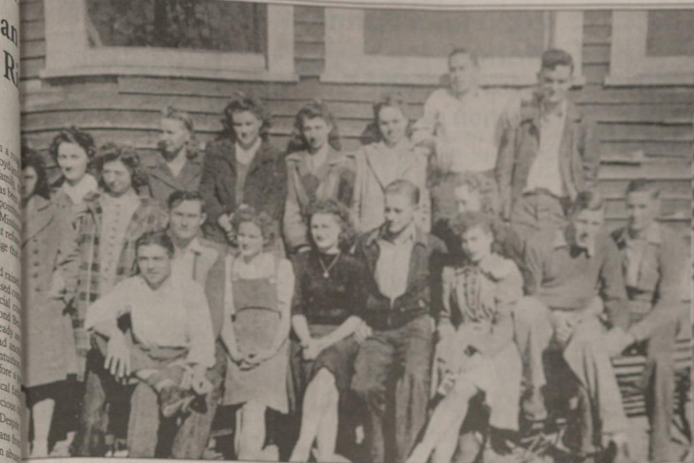
Tishomingo Class of 1944